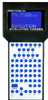
Universal Hand Held Controller