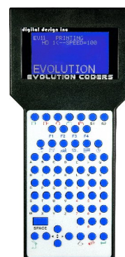
EVOLUTION Universal Controller

Complete PC control of the EVOLUTION I network through our EVOLUTION-NET software is available as an option.